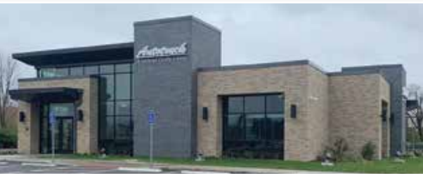
New Bowling Green office opening soon!

If you are trying to get your finances in shape, we offer many services that can help. From our Mobile App to our new Visa Saver Credit Card, we can help you no matter what your financial goals are this year.